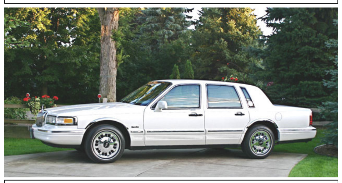
This picture perfect 1997 Town Car belongs to Rolland Toenges