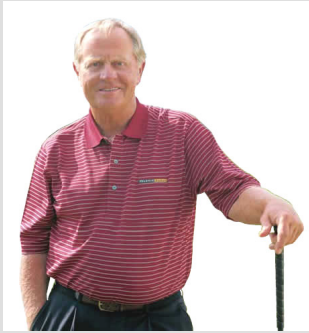
Jack Nicklaus One of the best golfers ever

Jack Nicklaus: "I never went into a tournament or round of golf thinking I had to beat a certain player. I had to beat the golf course. If I prepared myself for a major, went in focused, and then beat the golf course, the rest took care of itself."