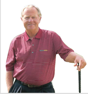
Jack Nicklaus One of the best golfers ever

Jack Nicklaus: "I never went into a tournament or round of golf thinking I had to beat a certain player. I had to beat the golf course. If I prepared myself for a major, went in focused, and then beat the golf course, the rest took care of itself."