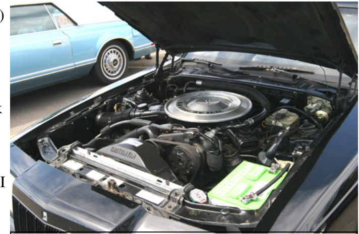
No garden variety MK VII engine here, lurking under the hood is a 351 Windsor block.

The first time I heard of the GTC option I thought to myself, "That's the coolest Mark VII I'll NEVER see". Well, when I decided that I absolutely had to replace a Mark VII that I had owned years ago, I stumbled across an ad on Craig's List of all places. The ad was a " 1986 GTC 5.8L" in Everett, Washington.