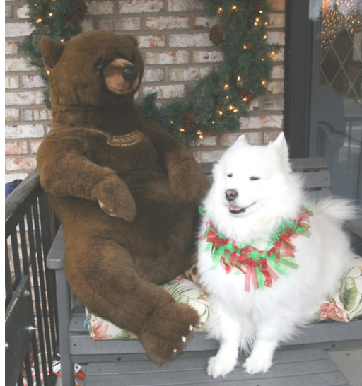
Faithie visiting with her friend, the Big Brown Bear, who can't hibernate, because there is no snow in Burnsville. Faithie whose ancestors were all sled dogs, also misses the snow.