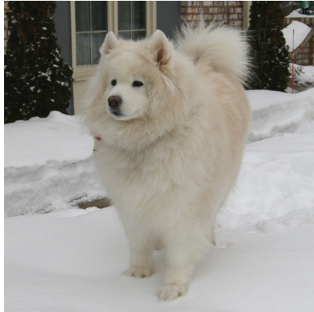
Ch. Faithie out enjoying the aftermath of our first heavy snowfall this year in Burnsville. She, however is the only one at 308 Brandywine that enjoys winter weather.

Also today, we are celebrating our 5 th anniversary with our beloved Faithie. It seems like only yesterday, that we went over to the Minneapolis-St. Paul airport and picked her up after her flight from Portland, OR. We had snow on the ground that day too, and she really was excited to see it. She has been a joy over these past years and has given us much more than she has received from us. Hopefully, she will travel with us to some Lincoln events in 2010 and she will have a chance to meet you and visit.