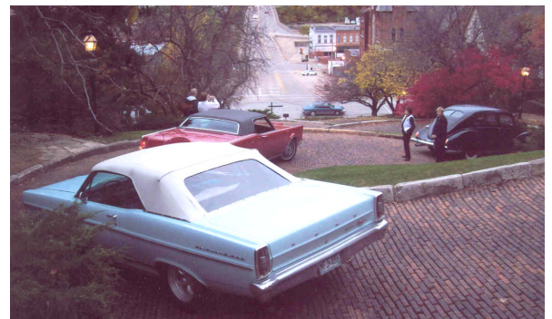
Checking out Snake Alley in Moline, IL