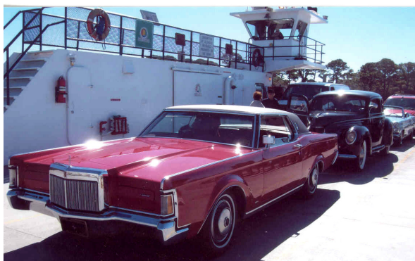
Our home away from home.

The next day, we stopped in Natchez, Ms. and toured some old mansions, and had lunch at The Castle restaurant at the Dunleith Mansion. We took some great car pictures there and at the Longwood Mansion. We were very impressed with the Spanish Moss and the vast cotton fields.