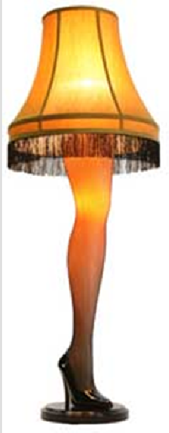
"The Major Award"

deep disillusionment with which Ralphie finally gets his Little Orphan Annie Secret Decoder Ring in the mail, and Annie's secret message turns out to be nothing but a crummy commercial.