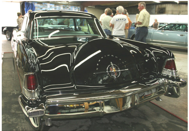
The Mark's paint and chrome is as close to perfection as you could ever expect. Absolutely beautiful.

The search was on for a painter who would work with single-stage paint. I had been shopping paint and in head to head comparisons, determined that PPG's Concept urethane was the closest I could come to the look and depth of lacquer. Despite the repeated warnings from body shops, I have never regretted staying away from base/clear, and appreciate the ultra-black finish this type of paint affords the user. It also buffs like a dream without swirling white as you will experi-