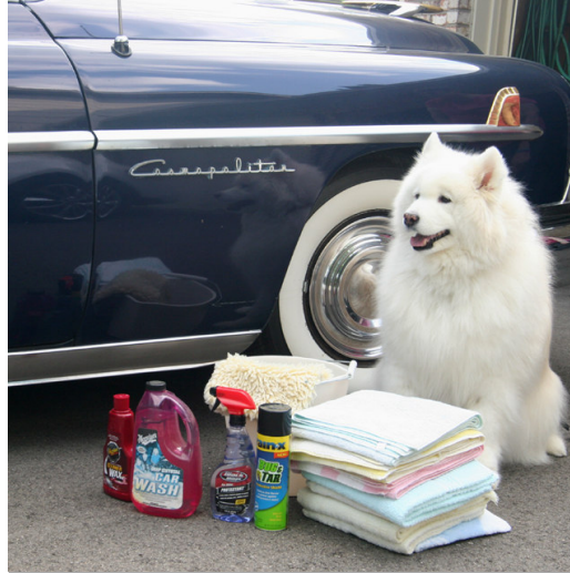
Now Look Dad, I don't care how many treats you promise me, I haven't any thumbs and so you can't expect me to help wash the Cosmopolitan.

the trip over to Pontiac, MI to take in the 2012 MidAmerica LCOC show. I hope to see a lot of LCOC members and get a chance to visit with them and