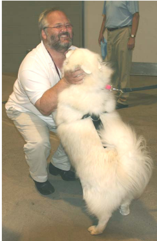
Official Greeter, Ch. Faithie bestowing kisses on one of guests.

It's almost August. What happened to June and July? June was a good month, the MidAmerica was at the end, and it was well received by all who attended. It's a shame that we could not have had a few more members and their cars, but for those who were there it was a truly memorable experience.