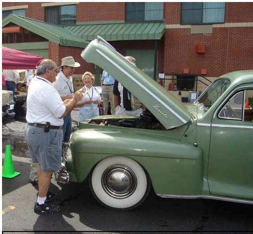
Mechanical judging underway.

takes anywhere from 20-30 minutes to build up a “head of steam” of sufficient pressure to be able to start moving the car. These are extremely interesting cars with their many gauges, faucets and other stuff necessary for their operation. I guess that our Lincolns of the 30’s and 40’s are very modern cars when you start to compare them to cars of this vintage. It is all relative.