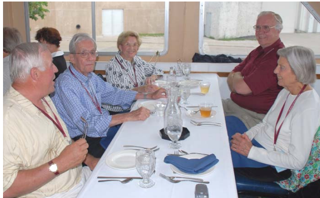
Enjoying the good company and food on Thursday night aboard the Vista Star.

Friday was reserved for mechanical judging, with the rest of the day set aside for people to enjoy many of the Duluth area attractions. However, the real action was at the Inn on Lake Superior hotel parking lot, where many of our members were preparing their cars for Saturday, and of course, checking out each others cars. There was much conversation, and a lot of picture taking with this beautiful collection of