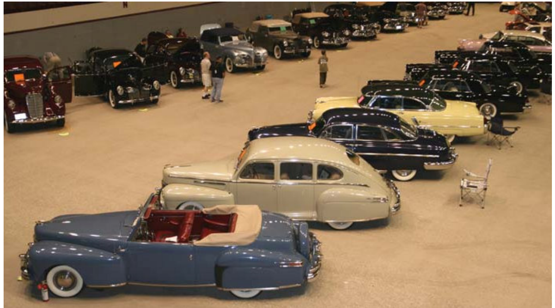
All the fine Lincolns ready for the show

The Mid America National Meet of the Lincoln and Continental Owners Club was hosted by the North Star Region in Duluth, Minnesota, June 25 th through the 29 th , 2008.