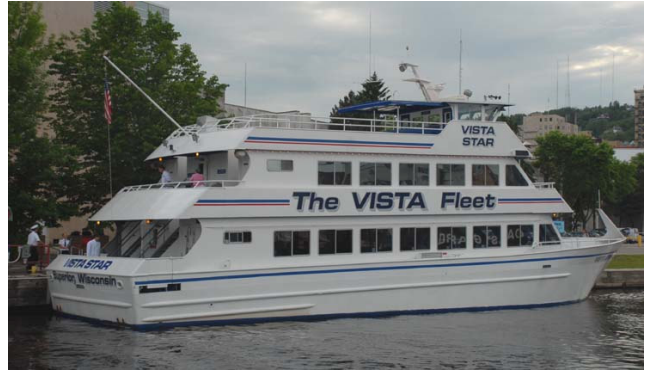
The Vista Star boarding for the dinner cruise.

Thursday evening, saw us dockside, boarding the Vista Star for a dinner cruise. While eating and socializing, we were able to see lighthouses, ships, sweeping vistas of Lake Superior and its Duluth Harbor during a narrated tour. The food and service were good, and a most enjoyable time was had by those on the cruise. Afterward, the open doors of the Northstar Hospitality room beckoned LCOCers for another round of visiting, and to greet the latest arrivals to the meet.