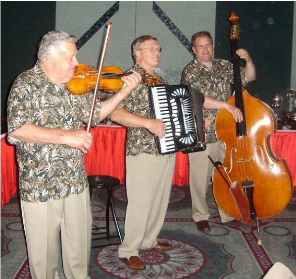
The "Strollers" entertained at the Saturday night Awards Banquet, going from table to table, playing all the old favorites.