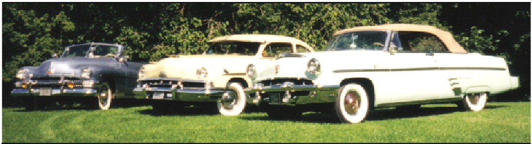
1951 Lincoln Coupe in the good company of '51 and '53 Mercury Convertibles

(Continued from page 1) our cars in pretty much the same condition that they left the dealership when they were new. Some feel that a modified car makes it a better car and perhaps that is true in some cases. The following is an excerpt from a letter I wrote and was published in the MSRA Linechaser in September, 2009. I think a larger majority of LCOC members will share my viewpoint.