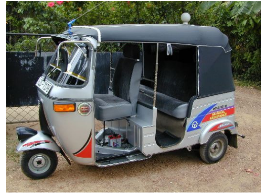
One of the first Tuk Tuks to arrive in Shafer.