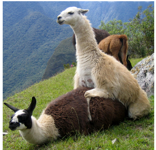
These sweet creatures provide constant amusement for adults, and a never ending stream of questions from young children.