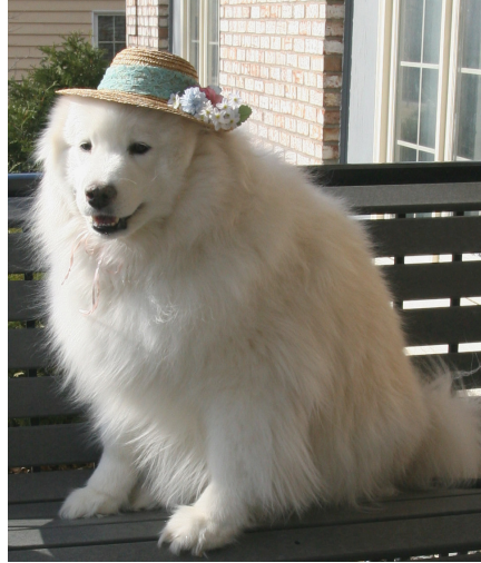
Ch. Faithie is looking forward to Easter, and the big parade! In her Easter bonnet, with all the frills upon it, she'll be the grandest lady in the Easter parade.