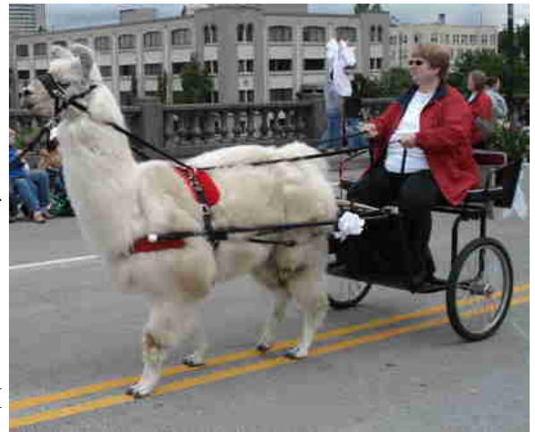
Look for Llama powered carts going back and forth between the Shafer airport and the downtown business district.