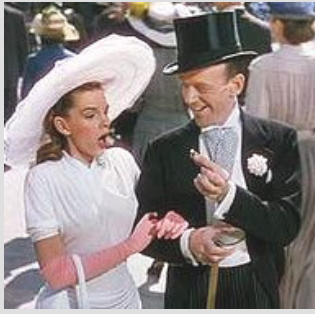
Easter Parade Staring Fred Astaire and Judy Garland.

In your Easter bonnet, with all the frills upon it, you'll be the grandest lady in the Easter parade.