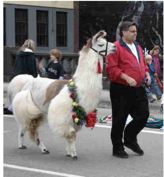
Llama's will be marching in the Shafer Founders Day parade this coming May.